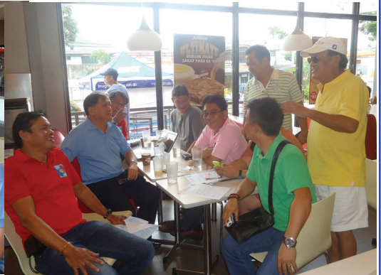
District Tenpin Bowling Tournament, Oct. 6, 2013