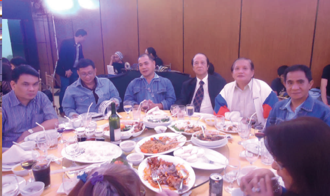
Bamboo Tree Planting Committee Meeting , Oct 3, 2013