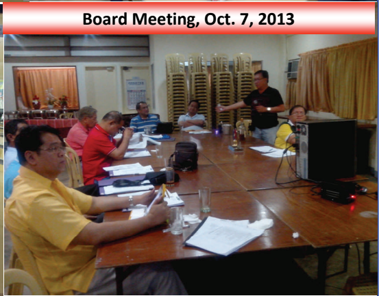
Board Meeting, Oct. 7, 2013