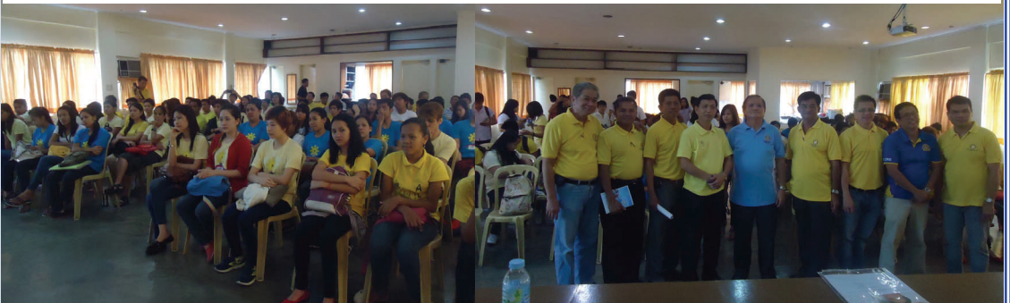
Youth participants and Rotarian attendees