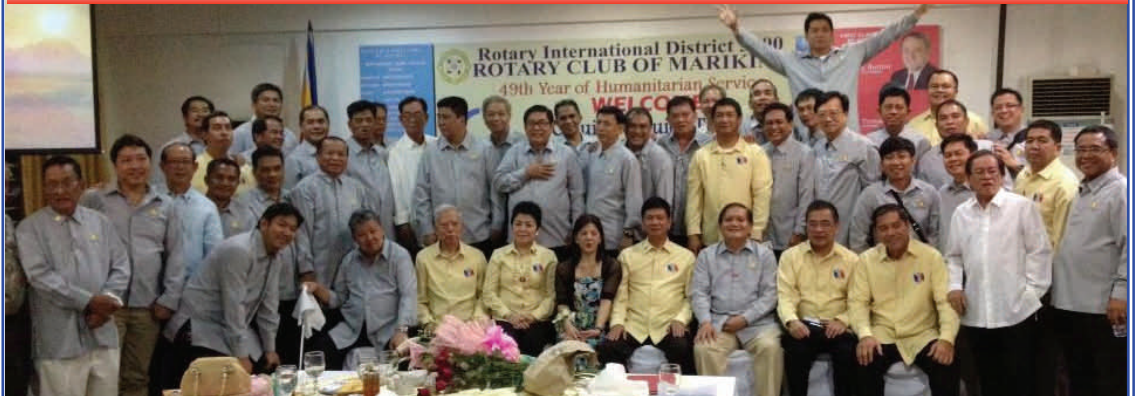
Int'l River Summit Technical Committee Mtg