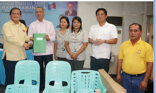
Donation of tables and chairs to Concepcion ES Sped Center