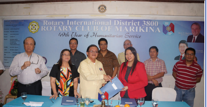
Sisterhood Signing with RC San Juan