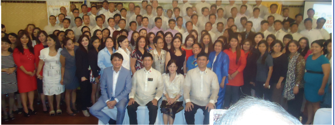
City Nutrition Meeting, Sept. 3, City Hall