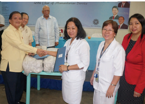
Donation of blankets to Amang Rodriguez Medical Center