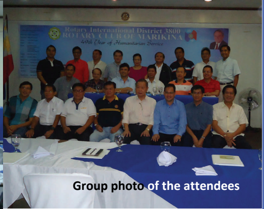
Group photo of the attendees